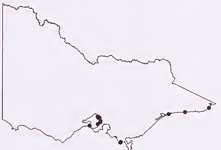
Figure 5. Distribution of Arthonia banksiae .

In his original description of A. banksiae , Müller also noted similarities to the tropical species, A. microsperma , from which his new species differed by